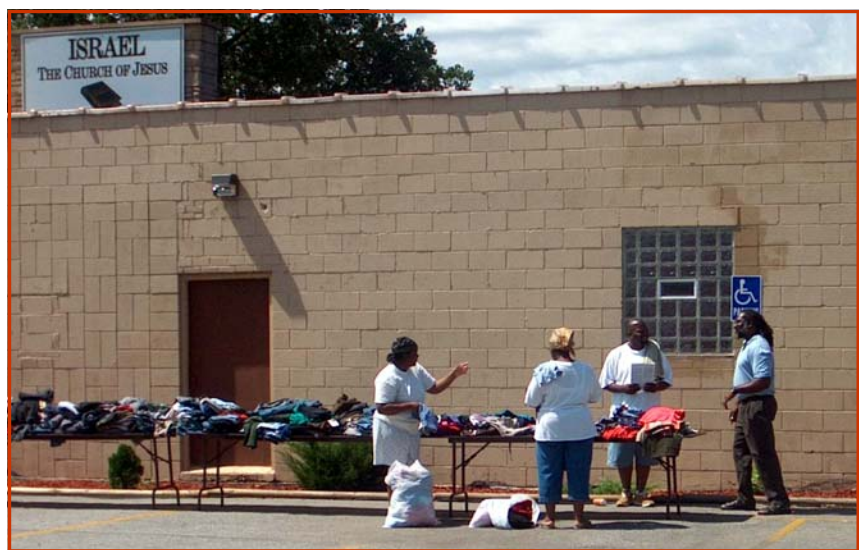
Annual Church Giveaway 2005